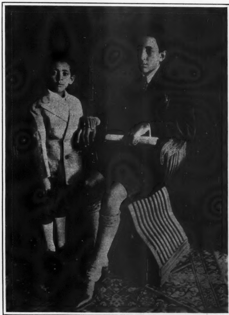
Heirs to the Throne of Ethiopia. Prince Asfa (seated) and his younger brother, Prince Makunen.